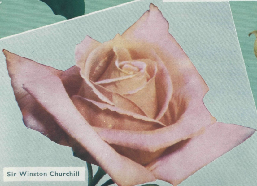
Sir Winston Churchill